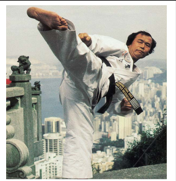
Master Chong Chul Rhee